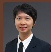
San Chaithiraphant Tilleke & Gibbins, Thailand